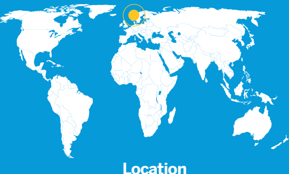
Os (Vestland), Norway

Moldestad Fjellsprengning AS is a drill and blast specialist company operating in the Western part of Norway. The five-person operation prepares sites for contractors, developers, local and regional governments and private citizens, enabling the construction of buildings, roads, structures, housing developments and private homes. In addition to construction preparation work, Moldestad is also involved in quarry blasting.